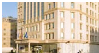
Barceló Cairo Pyramids | ★★★★★

This hotel is only 5 minutes from the Great Pyramids of Giza and a short distance from the center of Cairo providing contemporary rooms and accommodations. The rooms are fully air-conditioned and feature modern art prints. The stylish bathrooms include a shower and modern amenities.