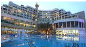
Daniel Dead Sea Hotel | ★★★★★

The hotel is within 1.2 m. from Petra. Guests can enjoy a continental breakfast with 5-star accommodation, plus an indoor pool. 24-hour assistance is available at the reception. All rooms have Wi-Fi access, tea and coffee making facilities, television, air conditioning, safe deposit box and a mini bar. The bathrooms are well equipped with bath/shower, hair dryer and complimentary toiletries.