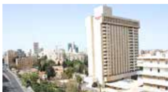
Leonardo Plaza Hotel Jerusalem | ★★★★★

The indoor rooftop pool of Regency Palace offers a panoramic view of Amman. The hotel is ideally located near the city center. Guests can enjoy the rich buffets at Al Madafa restaurant with Jordanian Cuisine, and Polynesian cuisine at Trader Vic's Restaurant, and at the bar you will find Cuban music and fine wines.