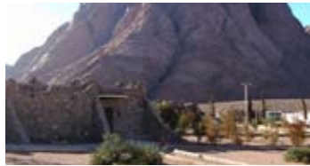
Wadi El Raha | ★★★★★

The Renaissance Tel Aviv Hotels offers 338 rooms and has a privileged location directly on the beach of the Mediterranean Sea and within easy access to dining, shopping, and entertainment. The extraordinary service & attention to detail will make your holy land trip a wonderful experience.