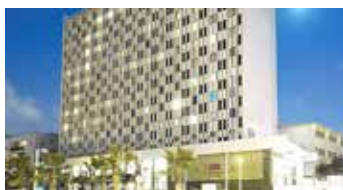
Grand Beach Tel Aviv Hotel | ★★★★★☆

This hotel is only 5 minutes from the Great Pyramids of Giza and a short distance from the center of Cairo providing contemporary rooms and accommodations. The rooms are fully air-conditioned and feature modern art prints. The stylish bathrooms include a shower and modern amenities.