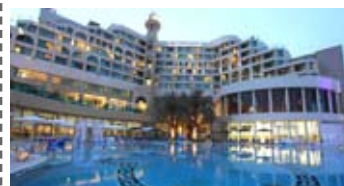
Daniel Dead Sea Hotel | ★★★★★

This hotel is a 10 minute drive from the entrance to the historic site of Petra. Situated at an altitude of 1,400 meters, this hotel offers breathtaking panoramic views over sweeping hillsides. The hotel was designed by the recipient of the Agha Khan Award for Islamic Architecture, Engineer Rasem Badran.