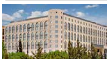
Grand Court Hotel Jerusalem | ★★★★★☆

The Grand Palace Amman is centrally located in the modern progressive district of Shumesani. The hotel offers 138 guest rooms fitted with air-conditioning, minibar, safe-box and wireless internet access with large bathrooms. The rooms are fitted with sound proof windows.