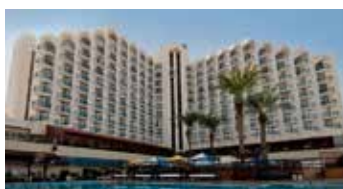
Leonardo Club Hotel Tiberias | ★★★★★☆

St. Catherine Village, Wadi El Raha is located in South Sinai and offers spacious chalets with a terrace. It boasts a restaurant with a 24-hour room service. The property features beautiful views of St. Catherine Monastery. All accommodation at St. Catherine Village, Wadi El Raha are air-conditioned and simply furnished.