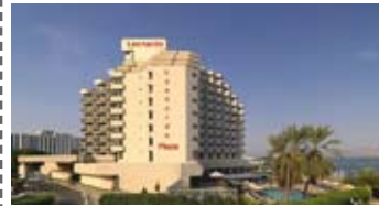
Leonardo Plaza Hotel Tiberias | ★★★★★

St. Catherine Village, Wadi El Raha is located in South Sinai and offers spacious chalets with a terrace. It boasts a restaurant with a 24-hour room service. The property features beautiful views of St. Catherine Monastery. All accommodation at St. Catherine Village, Wadi El Raha are air-conditioned and simply furnished.