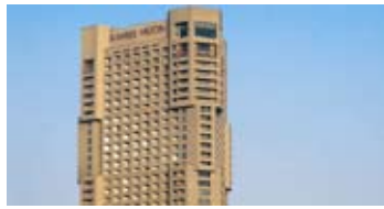
Ramses Hilton | ★★★★★

Ramses Hilton is situated in the Heart of Cairo near the Egyptian Museum. The hotel offers 3 restaurants along with 2 coffee shops/café's, a poolside bar, and a lounge bar. The 771 air-conditioned guestrooms include laptop-compatible safes and minibars.