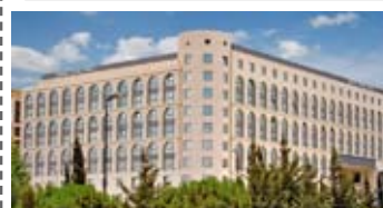
Grand Court Hotel Jerusalem | ★★★★★

The Grand Palace Amman is centrally located in the modern progressive district of Shumesian. The hotel offers 138 guest rooms fitted with air-conditioning, minibar, safe-box and wireless internet access with large bathrooms. The rooms are fitted with sound proof windows.