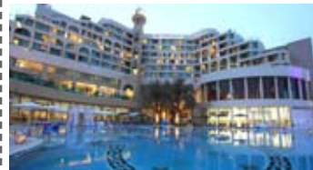
Daniel Dead Sea Hotel | ★★★★★

The hotel is within 1.2 m. from Petra. Guests can enjoy a continental breakfast with 5-star accommodation, plus an indoor pool. 24-hour assistance is available at the reception. All rooms have Wi-Fi access, tea and coffee making facilities, television, air conditioning, safe deposit box and a mini bar. The bathrooms are well equipped with bath/shower, hair dryer and complimentary toiletries.