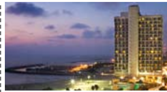
Renaissance Tel Aviv Hotel | ★★★★★

Ramses Hilton is situated in the Heart of Cairo near the Egyptian Museum. The hotel offers 3 restaurants along with 2 coffee shops/café's, a poolside bar, and a lounge bar. The 771 air-conditioned guestrooms include laptop-compatible safes and minibars.