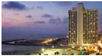
Renaissance Tel Aviv Hotel | ★★★★★

Ramses Hilton is situated in the Heart of Cairo near the Egyptian Museum. The hotel offers 3 restaurants along with 2 coffee shops/café's, a poolside bar, and a lounge bar. The 771 air-conditioned guestrooms include laptop-compatible safes and minibars.