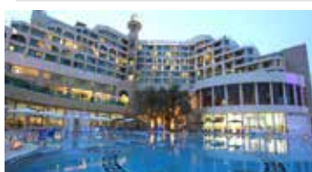
Daniel Dead Sea Hotel | ★★★★★

A 4-minute walk from the Petra Visitor Center, this upscale, family-run hotel flanked by Mountains is 6 km from the iconic Ad Deir monument carved from red sandstone. Warm rooms with a polished vibe offer flat-screen TVs, free Wi-Fi and minibridges, as well as tea and coffee-making facilities. Upgraded rooms offer mountain views. Airy family rooms add sitting areas. Room service is available.