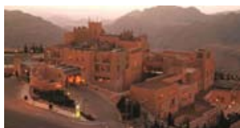
Mövenpick Nabatean Castle Hotel | ★★★★★

The Leonardo Club Hotel Tiberias is the perfect starting point to discover the attractive city of Tiberias, the Golan Heights, or to enjoy a stroll along the beautiful beaches. The hotel provides 398 elegant rooms with private balcony and outstanding facilities.