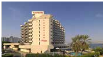
Leonardo Plaza Hotel Tiberias | ★★★★★

St. Catherine Village, Wadi El Raha is located in South Sinai and offers spacious chalets with a terrace. It boasts a restaurant with a 24-hour room service. The property features beautiful views of St. Catherine Monastery. All accommodation at St. Catherine Village, Wadi El Raha are air-conditioned and simply furnished.