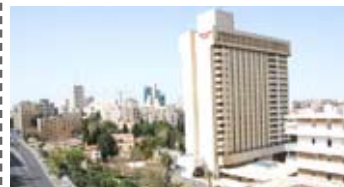
Leonardo Plaza Hotel Jerusalem | ★★★★★

The indoor rooftop pool of Regency Palace offers a panoramic view of Amman. The hotel is ideally located near the city center. Guests can enjoy the rich buffets at Al Madafa restaurant with Jordanian Cuisine, and Polynesian cuisine at Trader Vic's Restaurant, and at the bar you will find Cuban music and fine wines.