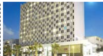
Grand Beach Tel Aviv Hotel | ★★★★★

This hotel is only 5 minutes from the Great Pyramids of Giza and a short distance from the center of Cairo providing contemporary rooms and accommodations. The rooms are fully air-conditioned and feature modern art prints. The stylish bathrooms include a shower and modern amenities.