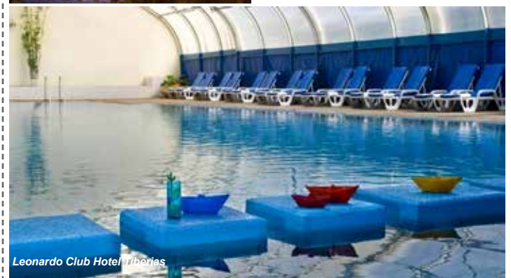
Leonardo Club Hotel Tiberias

Daniel Dead Sea Hotel is a luxurious 5 star property conveniently located only 6.2 mi from the centre of Dead Sea. The hotel boasts 302 fully equipped bedrooms. Enjoy a meal at one of the hotel's 3 dining establishments plus a café. From your room, you can also access 24-hour room service.