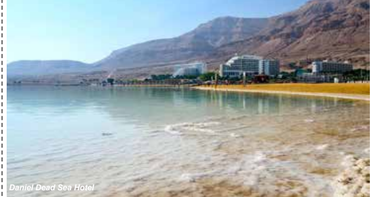
Daniel Dead Sea Hotel

Daniel Dead Sea Hotel is a luxurious 5 star property conveniently located only 6.2 mi from the centre of Dead Sea. The hotel boasts 302 fully equipped bedrooms. Enjoy a meal at one of the hotel's 3 dining establishments plus a café. From your room, you can also access 24-hour room service.